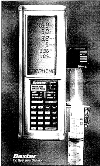
Baxter Infusion Pump used to dispense pain medication