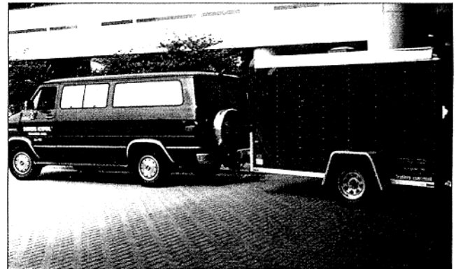
10 Foot Trailer for the Hospital Van used to transport medical equipment and records to outreach clinics held throughout New England and New York State

Tabs are saved by individuals and groups and are brought to the hospital in jars, bags, boxes, crates, and barrels. They come from everywhere—all over New England, New York and even some from as far away as California!