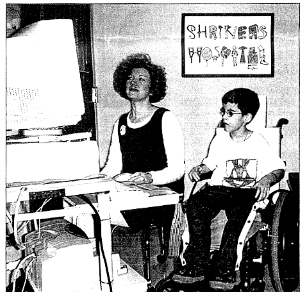
Computerized Pressure Mapping a force sensing array used in evaluating pressure distribution for patients requiring customized wheelchair seating systems